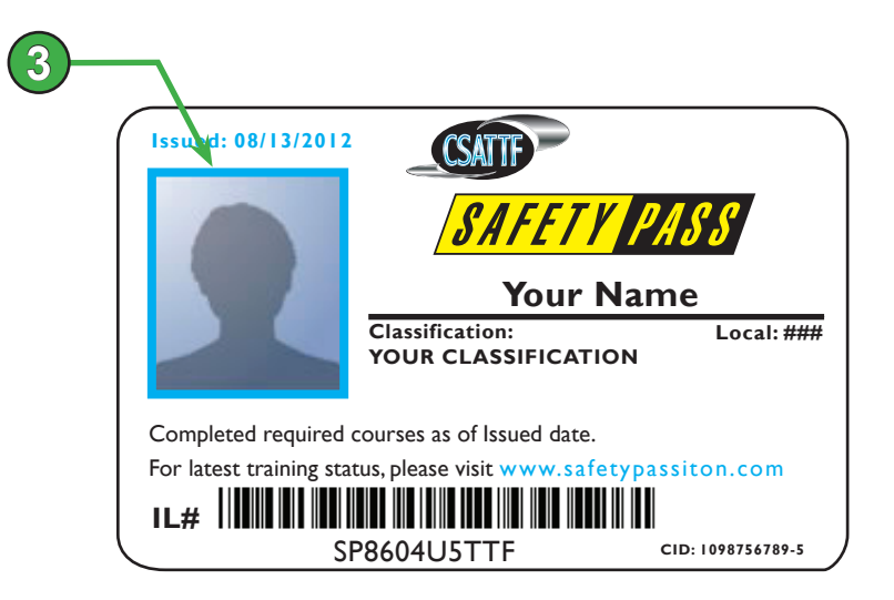
Photo of the individual. If individuals do not have a photo in our system, they will be asked to take a photo the next time they come to Safety Pass. A Passcard will not be issued unless a photo exists in our system.