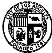
RICHARD J. RIORDAN Mayor